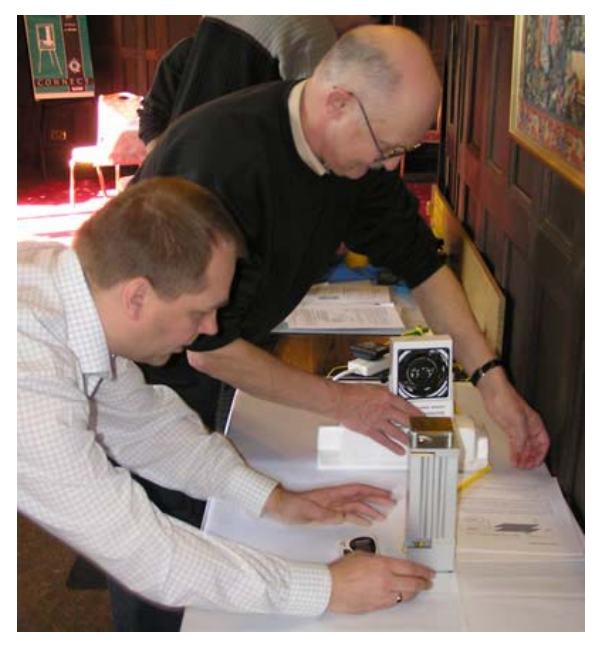
Delegates measuring ioniser performance during Session 3

Courses are provided in an attractive and comfortable venue with lunch and coffee provided. Place availability is limited and so we advise early registration. An intensive onsite ESD course can be provided if required.