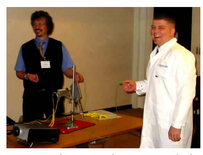
Measuring the static voltage on your body can be quite surprising!

This course is suitable for those who need to have a good understanding of how to implement an ESD Program in electronics manufacture, including